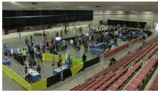
Fig. 6. Overview of the demo day Duckietown installation layout. Over one thousand duckies were taken by the public on that day.

The public walked a path through the installation being gradually introduced to increasing levels of abstraction, from the mechanical design of a Duckiebot to “parallel autonomy” [28] and intersection coordination of multiple robots. At each station students presented posters describing the underlying mechanisms, ensured the continuous and correct operation of their demonstrations and answered questions from the public, effectively disseminating their work. Mentors oversaw the students’ efforts to ensure smooth operations.